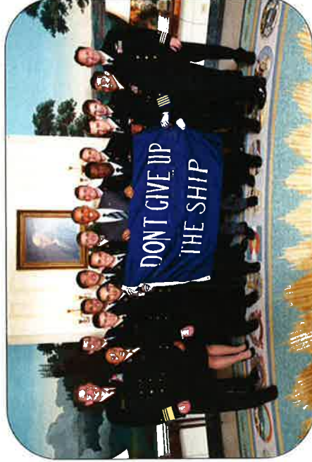
President Obama congratulating the winners of the 2015 Cyber Defense Exercise