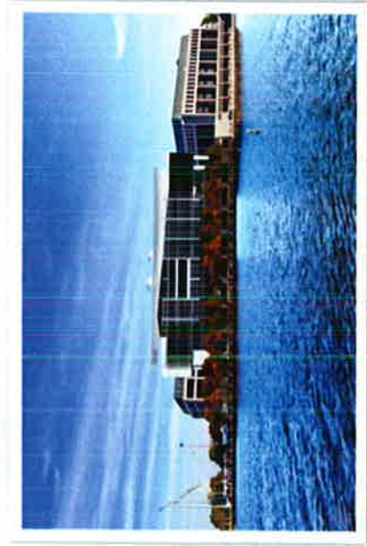
The Cyber Building will be built in the corner between Rickover and Nimitz Library, overlooking College Creek