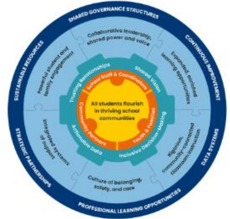
Four Pillars of Community Schools

Essentials for Community School Transformation