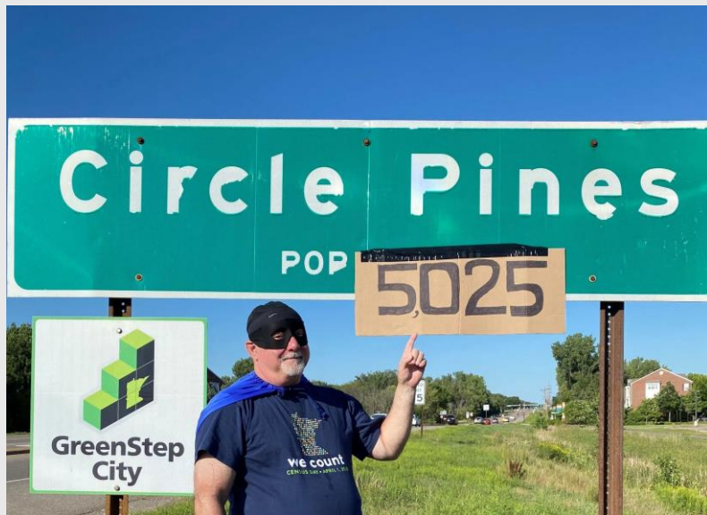
Example 1: Circle Pines, MN

1.5 million dollars for Circle Pines over next 10 years