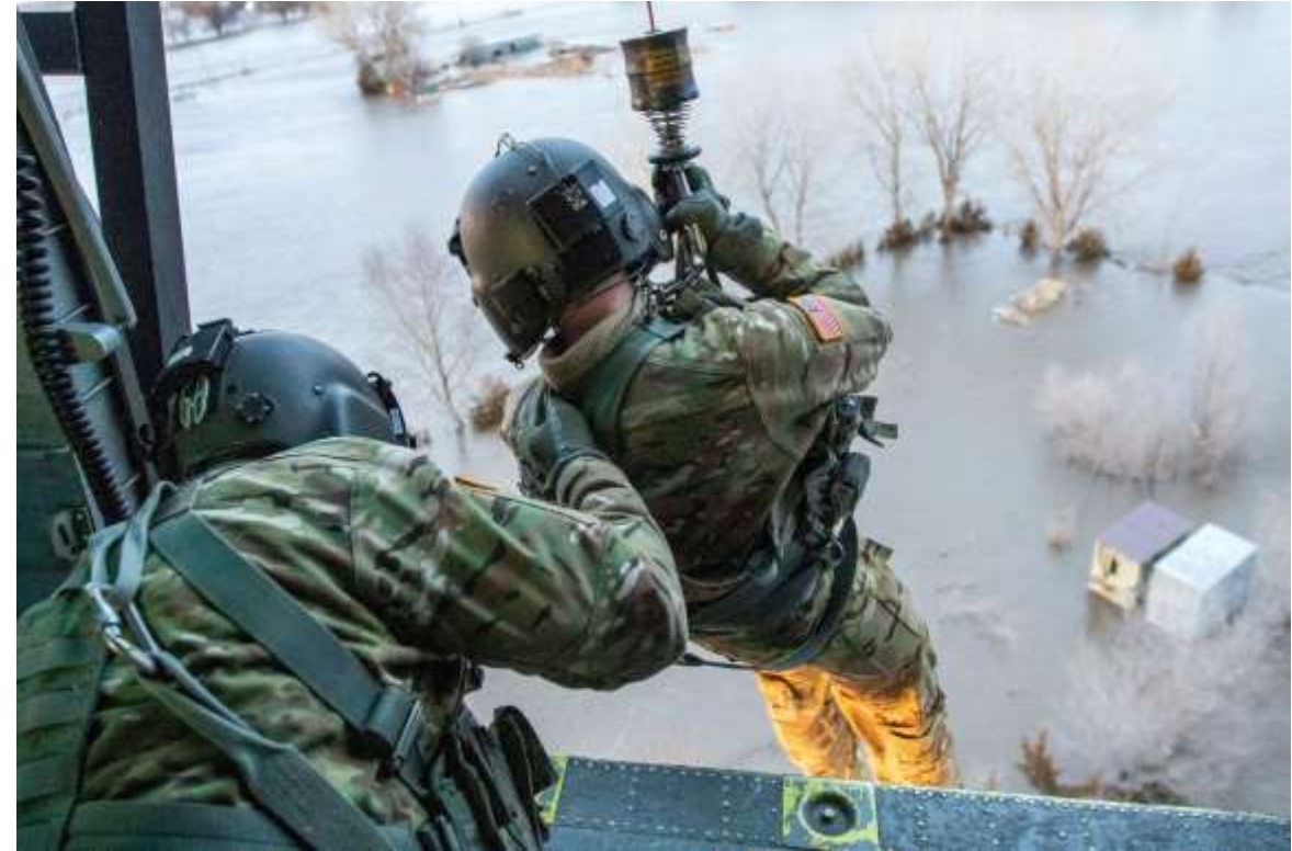
A Nebraska Army National Guardsman descends from a helicopter during flood response efforts near Columbus, Neb., March 14, 2019.