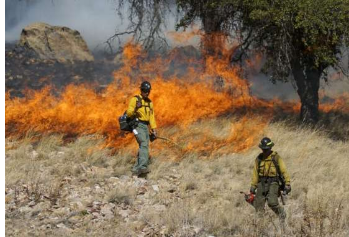
Fort Huachuca received FY20 REPI Challenge funding to protect over 2,000 acres of working ranches within the Fort Huachuca Sentinel Landscape. Portions of this land would contribute to natural resources management projects.