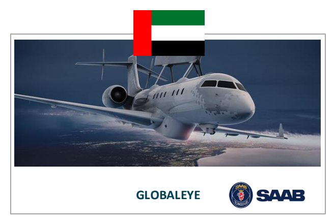
Global 6000 Swing Role Surveillance Mission