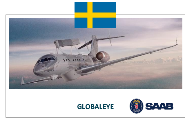
Global 6000 Airborne Early Warning Mission