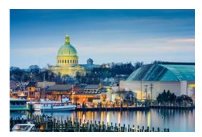
Annapolis, Md., Sept. 12-15, 2017

Join us at the NALIT Professional Development Seminar (PDS) in Annapolis. Combine opportunities to stay up-to-date on the latest developments in legislative information technology while visiting the oldest state capitol still in continuous legislative use.