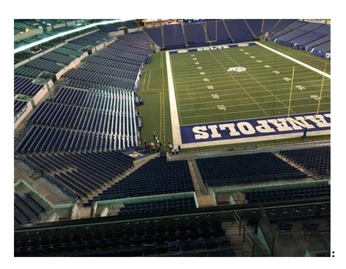
Social Event at Stadium