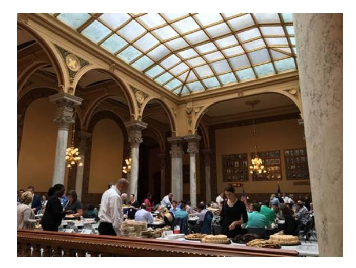
Luncheon Keynote: Apple Encryption Debate, Fred Cate