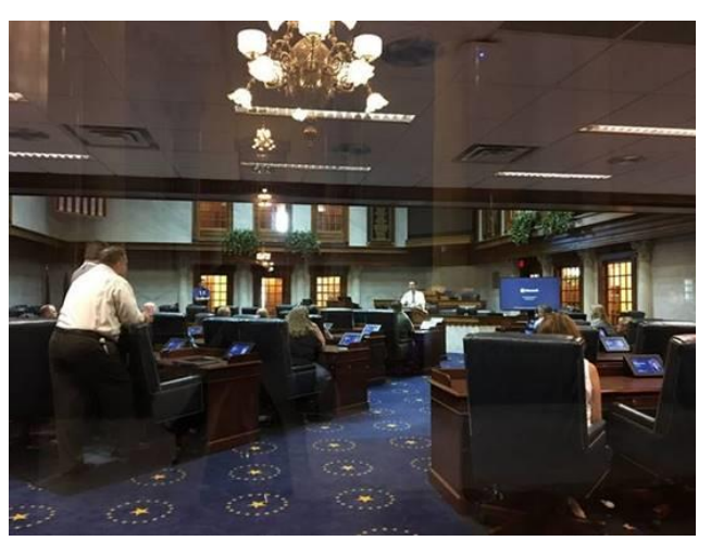
Briefings in the Chamber