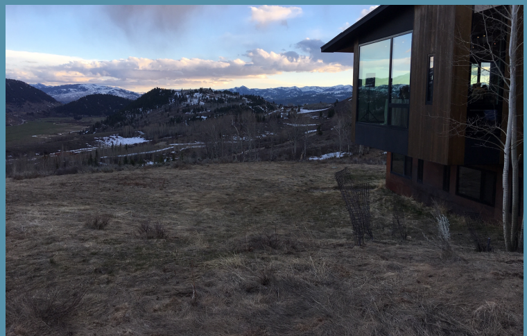
ASLCS members were invited to enjoy the music of Chuck Leavell at a private home with beautiful views of WY.