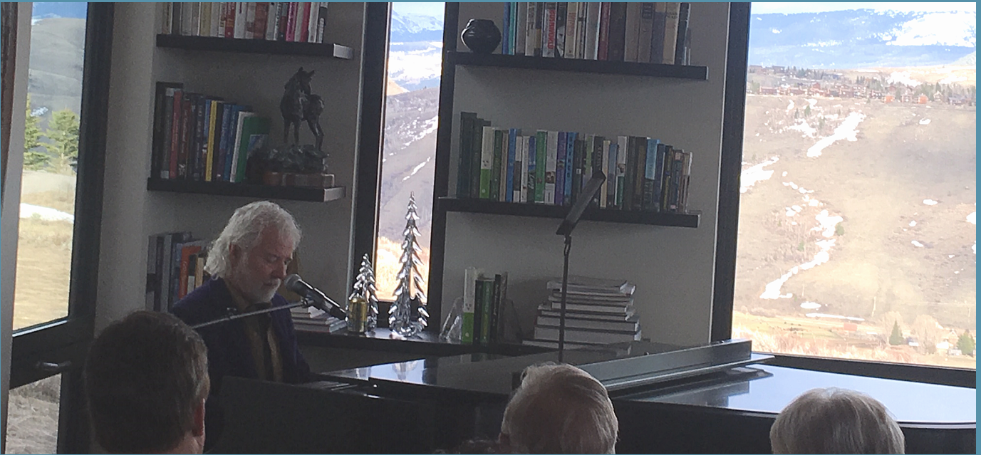
Music legend Chuck Leavell providing a memorable night for ASLCS.