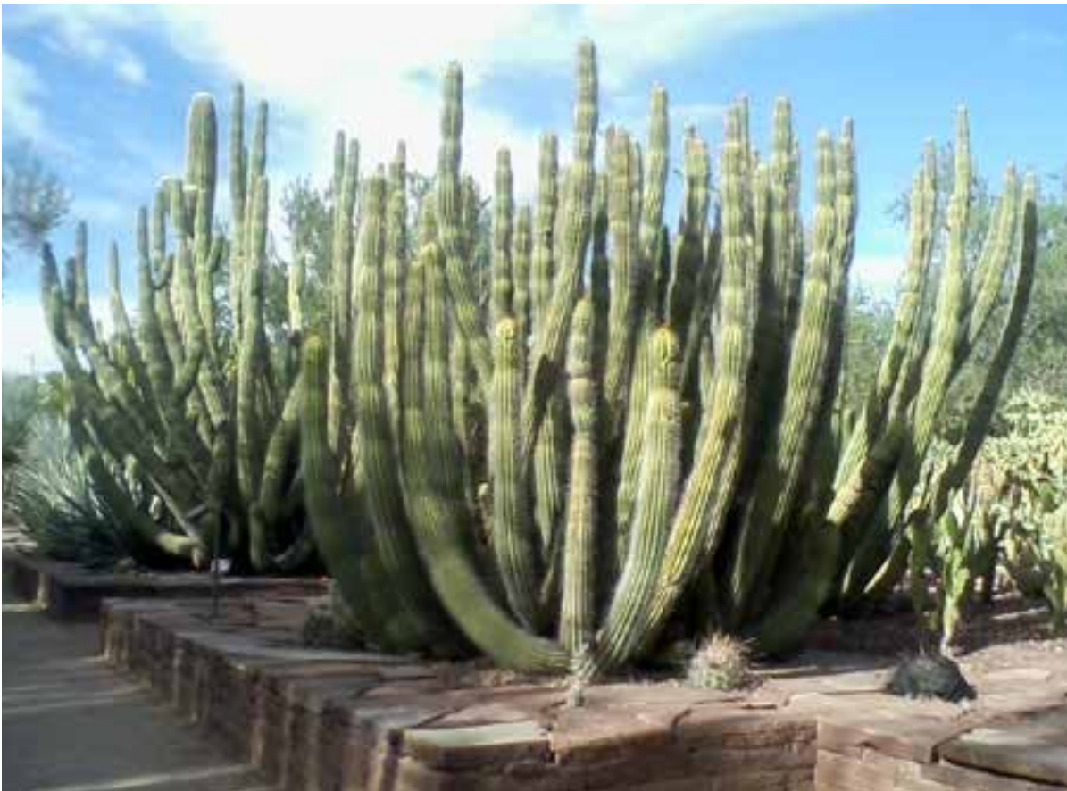
Organ Pipe Cactus, Desert Botanical Garden