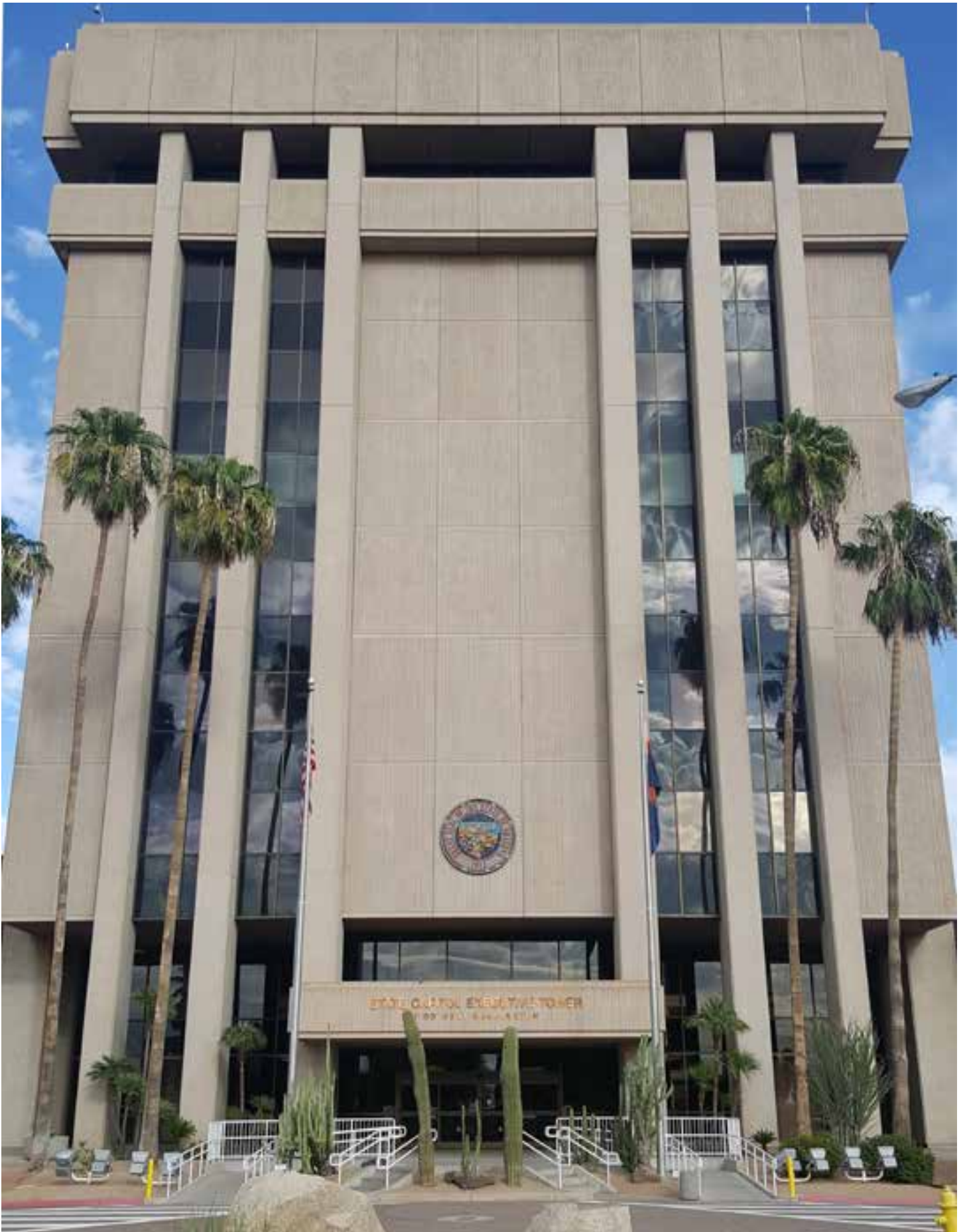
State Capitol Executive Tower • Phoenix, Arizona