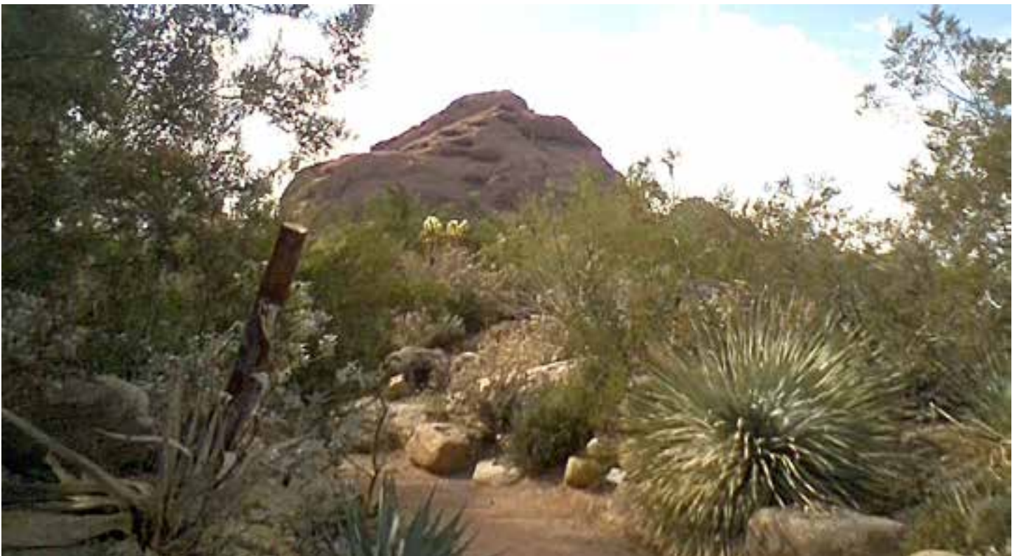
Desert Botanical Garden