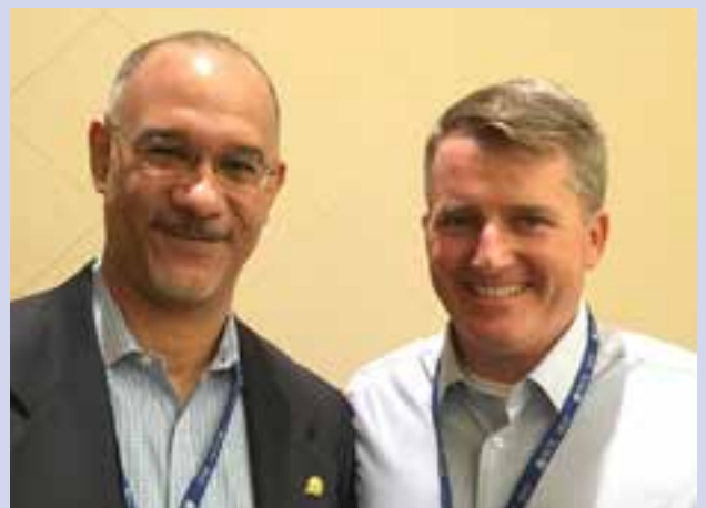
Winners of the Millicent (Millie) MacFarland Memorial Scholarship

Each participant is eligible to receive a minimum of $500 toward expenses.