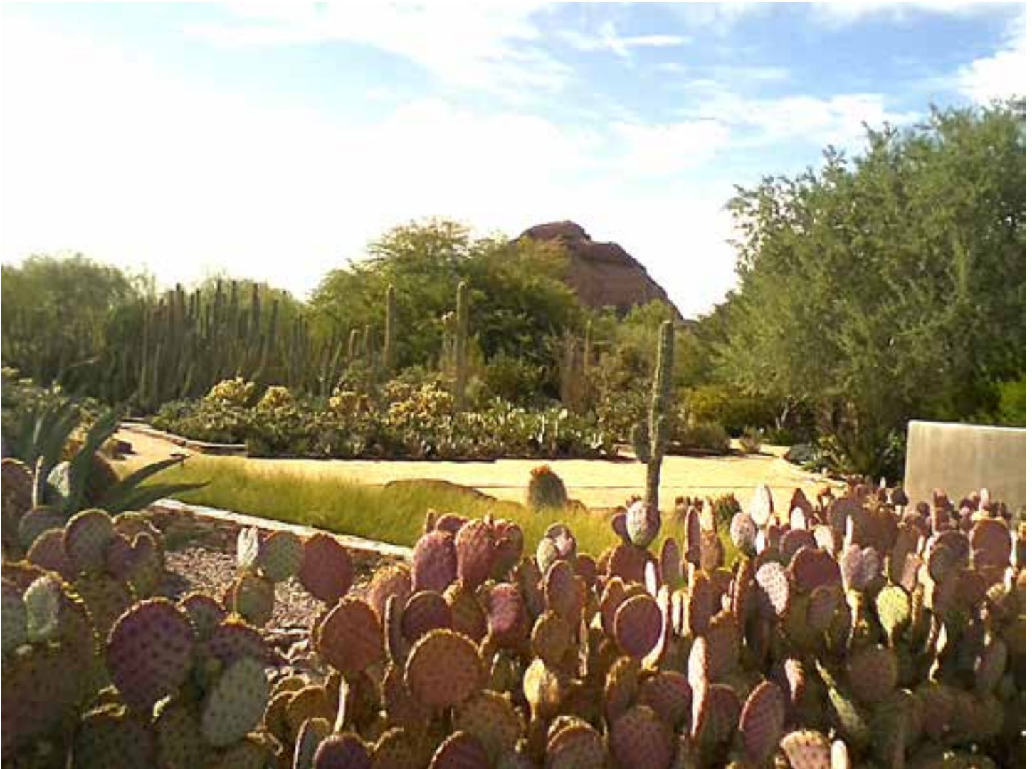
Prickly Pear Cactus, Desert Botanical Garden