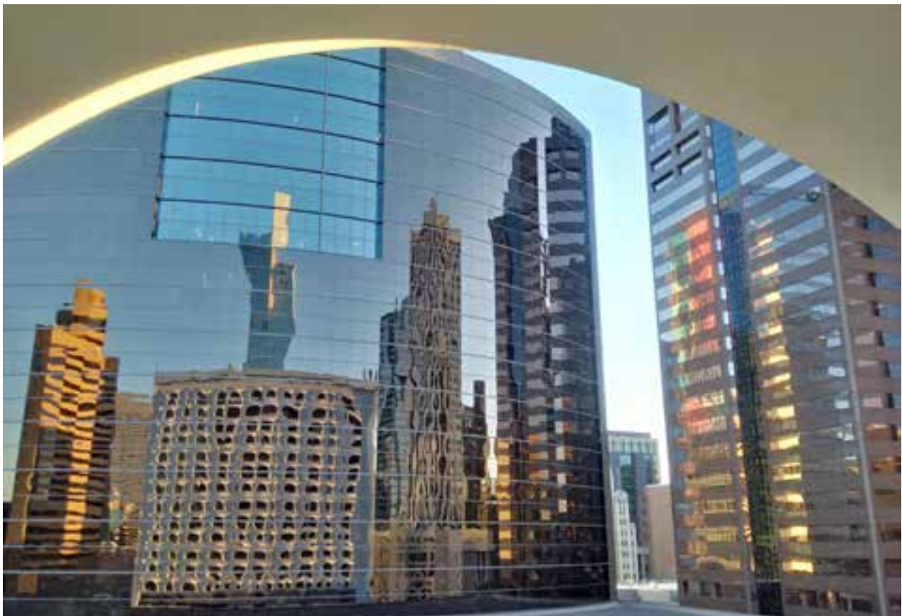
Downtown Phoenix Skyline