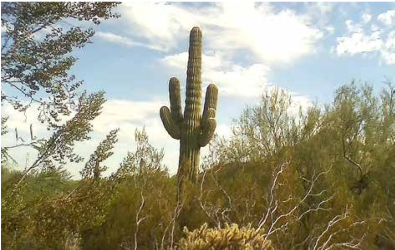
Saguaro Cactus, Desert Botanical Garden