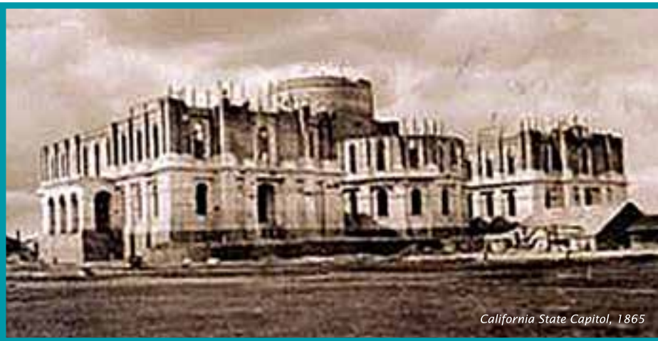
California State Capitol, 1865

The newly elected members, 16 Senators and 36 Assemblymen, convened on December 15, 1849, adjourning sine die April 22, 1850. The two houses actually sat 103 out of 129 calendar days.