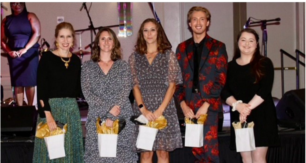
Lasting Impression Award Recipients