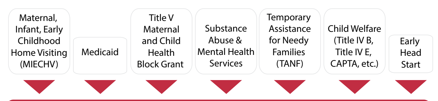
Figure 1. Key Federal Funding Streams Used to Support Home Visiting

Combined with required matching funds, state general revenues, and other funds (e.g., Children's Trust Fund, tobacco settlement, private dollars)