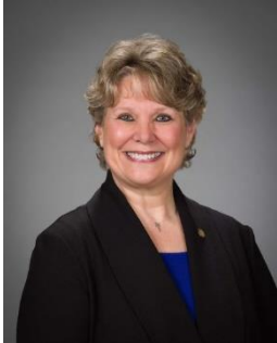
Representative Denise Garner

Capitol Address: 500 Woodlane Street Little Rock, AR 72201 Phone: (501) 682-7771 denise.garner@arkansashouse.org