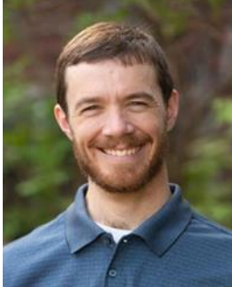
Representative Zack Fields

Capitol Address: State Capitol Room 24 120 4th Street Juneau, AK 99801 Phone: (907) 465-2647 representative.zack.fields@akleg.gov