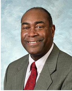
Senator Donald R. Douglas

Capitol Address: 702 Capital Avenue Annex Room 229 Frankfort, KY 40601 Phone: (502) 564-8100 donald.douglas@lrc.ky.gov