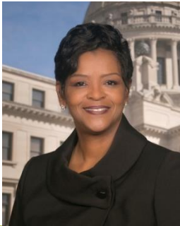
Senator Angela Turner-Ford

Capitol Address: Room: 409 P.O. Box 1018 Jackson, MS 39215 Phone: (601) 359-43237 aturner@senate.ms.gov