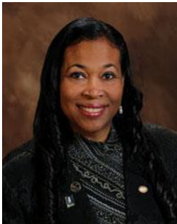
Senator Oletha Faust-Goudeau

Capitol Address: Room: 135-E SW 8th &, SW Van Buren Street Topeka, KS 66612 Phone: (785) 296-7387 Email: Oletha.Faust- goudeau@senate.ks.gov