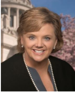
Senator Nicole Boyd

Capitol Address: Room: 213 P.O. Box 1018 Jackson, MS 39215 Phone: (601) 359-4088 nboyd@senate.ms.gov