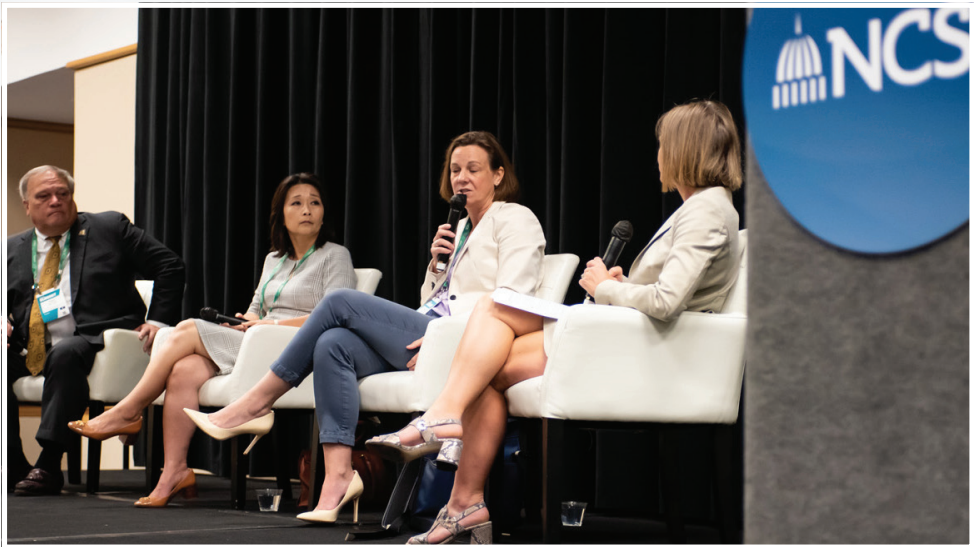
Panelists discuss policy issues at the NCSL Legislative Summit in Tampa Bay, Fla.

NCSL BASE CAMP 2021 Aug. 3–5, 2021 | Online