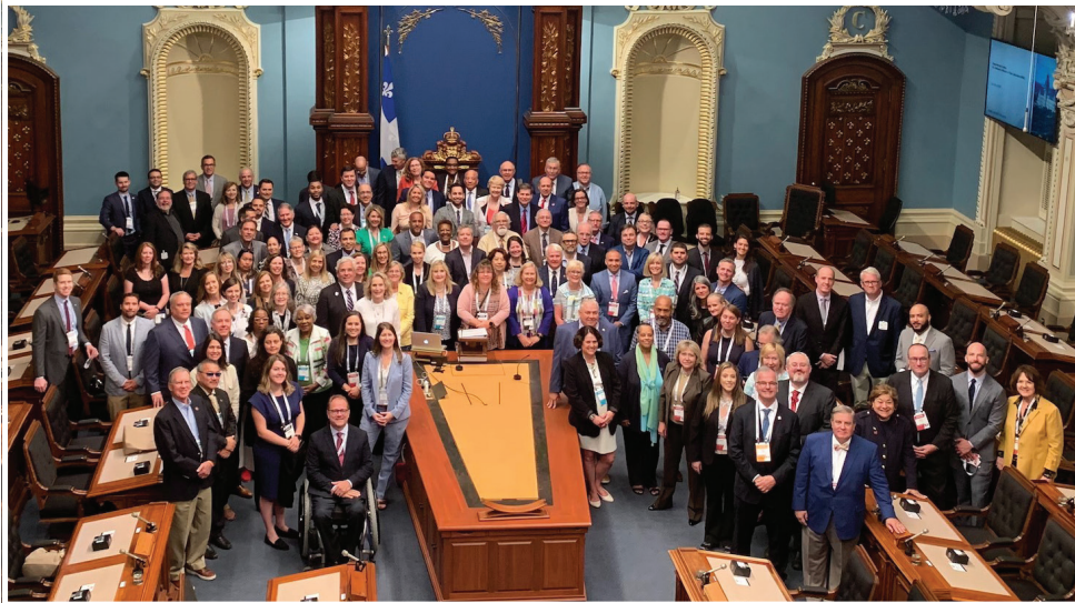
Legislative Leaders, Capitol Circle and Platinum Foundation sponsors received a tour of the National Assembly Chamber in the Parliament Building in Quebec, Canada during the Legislative Leaders Symposium in June 2022.

Dec. 6–9, 2021 | Old Town Alexandria, Va.