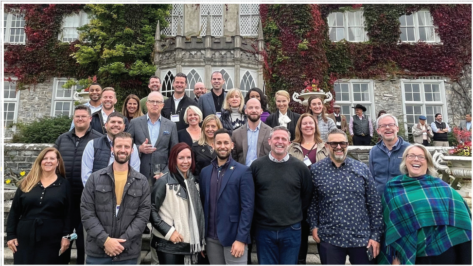
NCSL Foundation sponsors visiting a castle in Dublin, Ireland, at the NCSL Legislative Leaders Symposium, Oct. 2021.