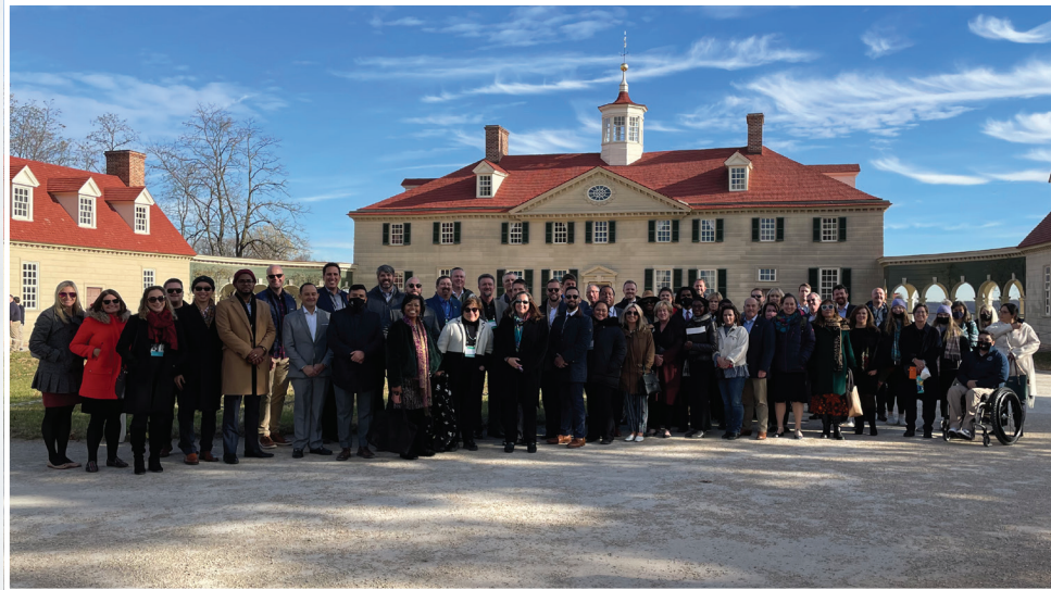
The entire group of emerging leaders and Foundation sponsors gather in front of George Washington's mansion at Mt. Vernon in Dec. 2021.