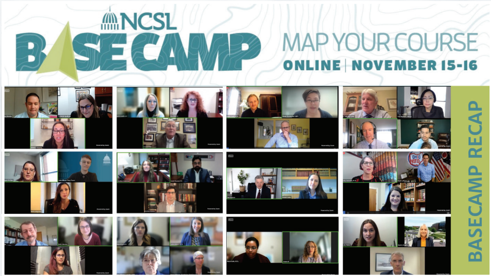
A recap of NCSL Base Camp, Nov. 15-16, 2021.