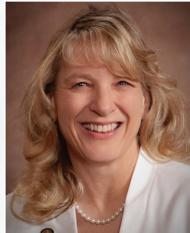
Sen. Elaine Bowers, Topeka, Kan.