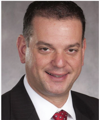
Rep. Angelo Puppolo, Boston, Mass.